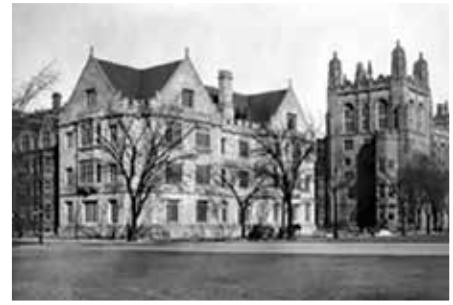
The first annual conference of the newly formed Association of Superintendents of Buildings and Grounds of the Central Western Colleges and Universities met in Chicago in spring 1914. Attendees stayed at the Sherman House, left, and met on the campus of the University of Chicago, where construction of a new classics building, right, was underway.